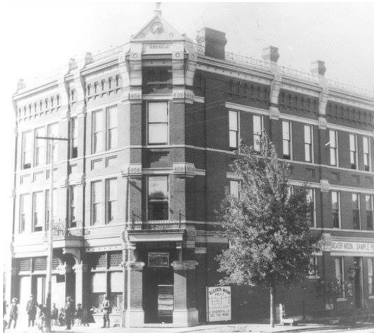
Historic photo circa 1897