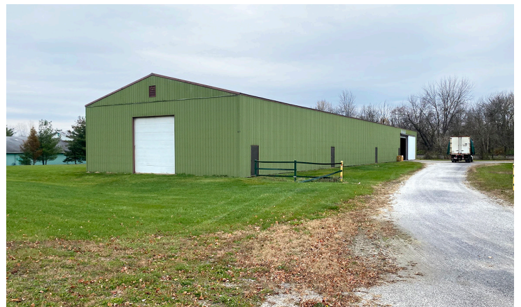
Building 2 - Exterior