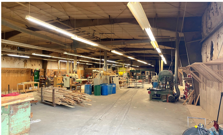
Building 1 - Interior