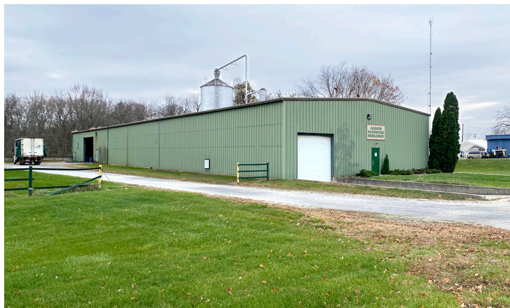
Building 1 - Exterior