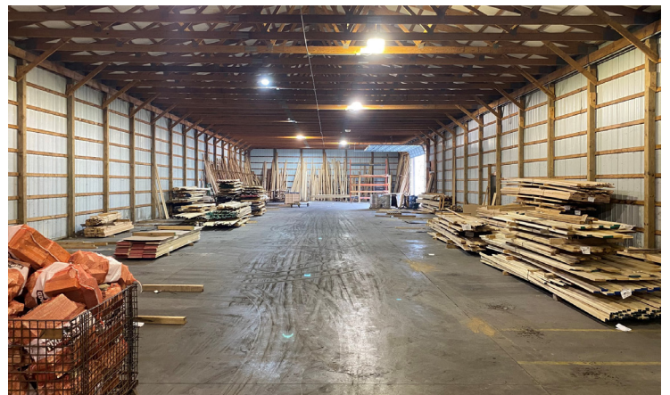
Building 2 - Interior