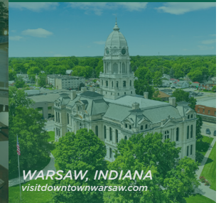
WARSAW, INDIANA visitdowntownwarsaw.com