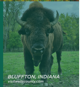
BLUFFTON, INDIANA visitwellscounty.com