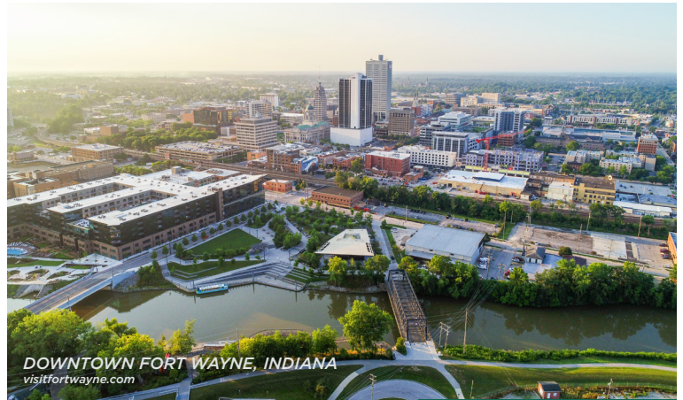
DOWNTOWN FORT WAYNE, INDIANA visitfortwayne.com

Northeast Indiana is in good hands. With a great location, thriving culture, strong workforce and education, and booming economy and business sector, you can rest assured that this is the place to be.