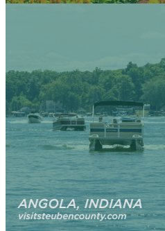
ANGOLA, INDIANA visitstebencounty.com