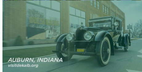
AUBURN, INDIANA visitdekalb.org

#13 Top States for Doing Business (CNBC, 2023)