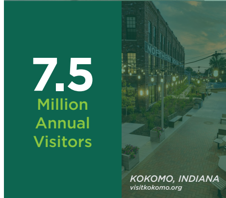
KOKOMO, INDIANA visitkokomo.org

#13 Top States for Doing Business (CNBC, 2023)